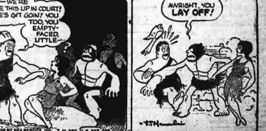
ALLEY OOP Look Out, Eeny!