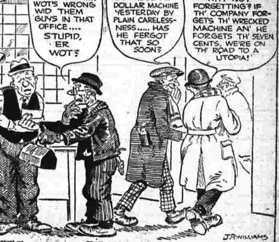
THE KICK By WILLIAMS