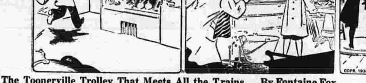
THE TOONERVILLE TROLLEY THAT MEETS ALL THE TRAINS By Fontaine Fox