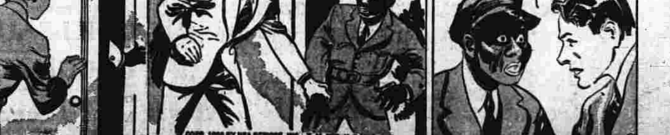
"I said antidote-not nanny goat!"