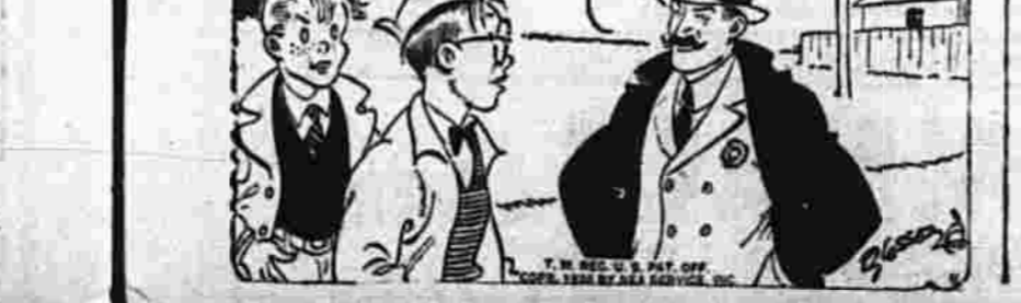
First Window Washer-Look at that guy in these kites! Another man's wife. Let's go in after the big bird, how soon do you think he will leave?

Here is a gentle hint gleaned from Pathfinder: Snowfoot (after midnight)-Did you know that I can imitate any bird that you can name? Zimph-Indeed! Suppose you start with the homing pigeon. A Mother's Plea! Oh, time, stand still for me a little while! And tomorrow wait! So soon the years will pass by my boy, and I must smile and smile and smile and smile through tears! We're so happy now-oh, let us dear time, stand still a little while!