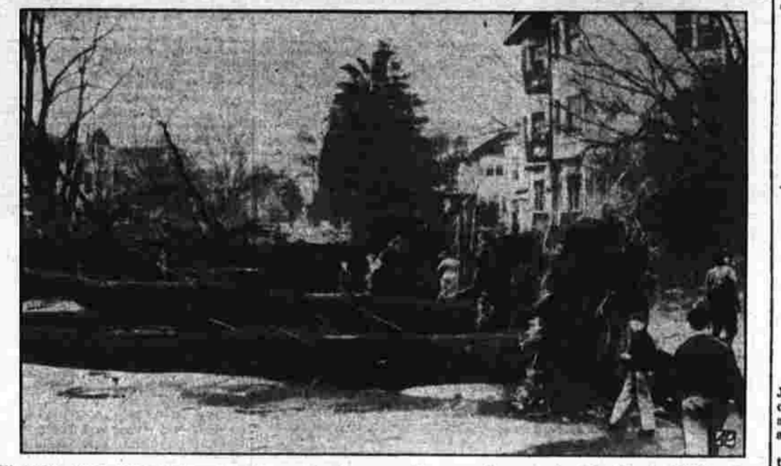
Chinching two weeks of stormy weather, a hurricane swept over a large part of California, killing five persons and causing damage running into millions of dollars. At Sacramento, where this picture was taken, the wind was the worst in the city's history. Five 50-year-old shade trees, lining a street leading to the capitol, are shown flattened as though they were twigs.