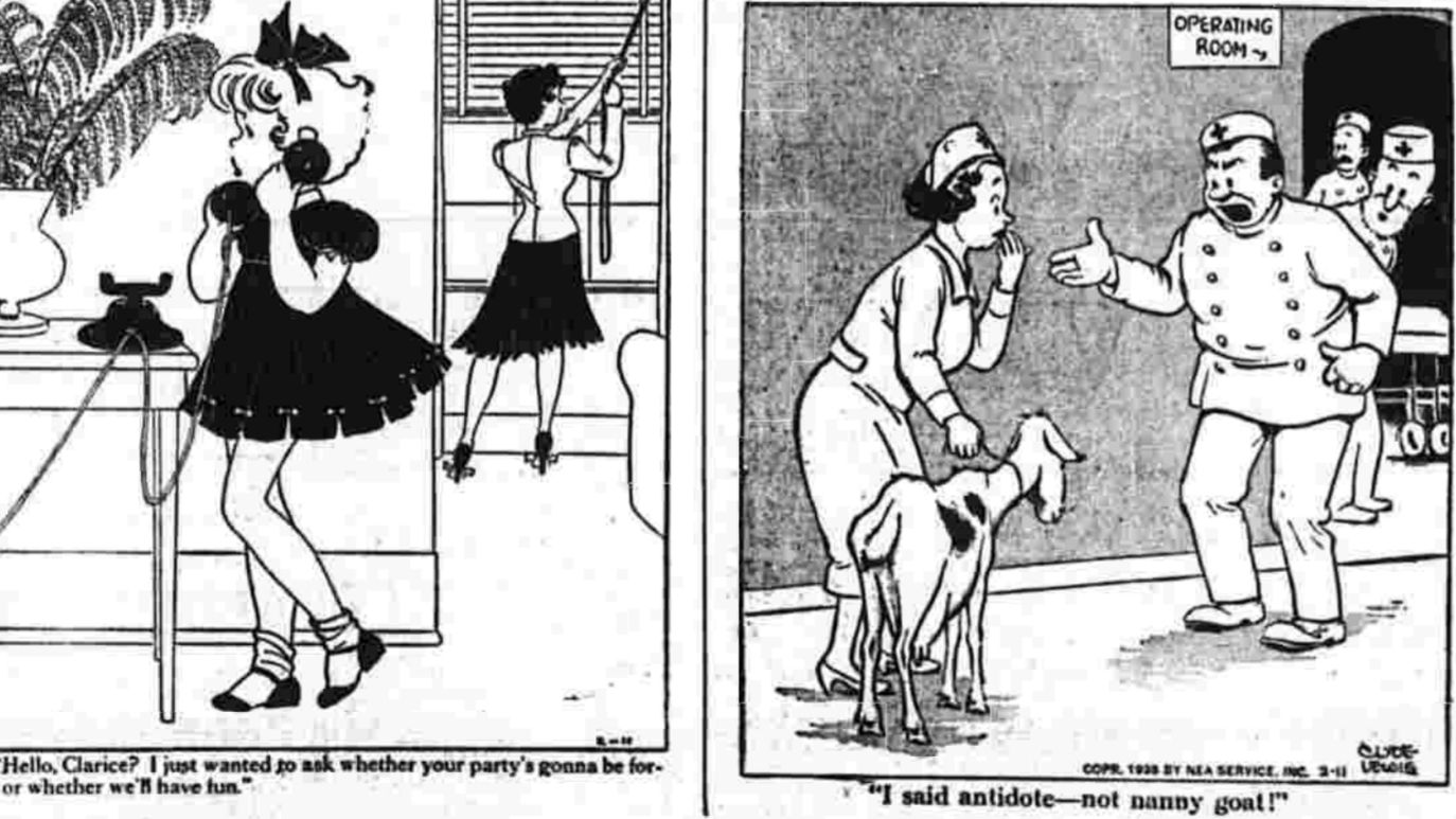
"Hello, Charley? I just wanted to ask whether your party's gonna be formal or whether we'll have fun."